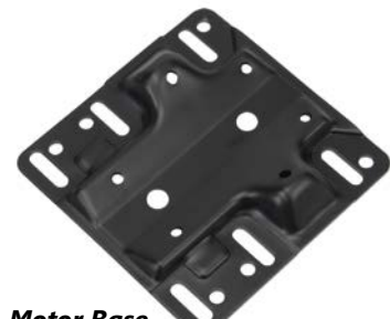
Motor Base MTA2-BASE-56