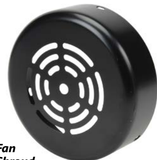
Fan Shroud MTA2-SHROUD-56