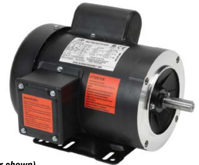
MTR2 Series 1-phase motor (model without run capacitor shown)