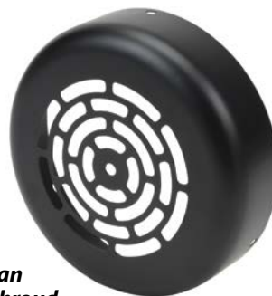
Fan Shroud MTAR-SHROUD-56