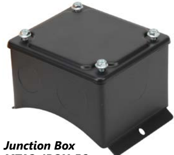
Junction Box MTA2-JBOX-56