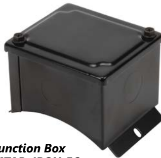
Junction Box MTAR-JBOX-56

(MTR series motors have only the one centrifugal switch.)