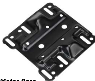
Motor Base MTAR-BASE-56