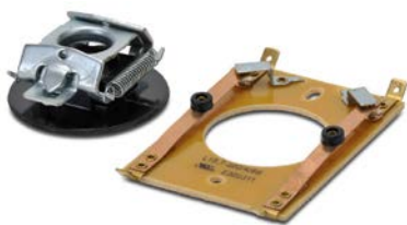
Centrifugal Switch MTA-CSW-01