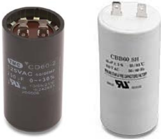
Start Capacitor MTA-CAP-02 Run Capacitor MTA-CAP-06