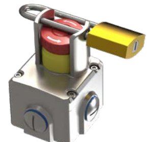
Type ESL-SSLP with button protection guard and padlock holes

(Padlock hole diameter 1/4". Padlock shaft must exceed 2" closed)