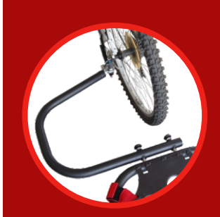
Bike Tow Attachment