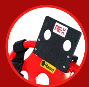
Patient Comfort Headrest