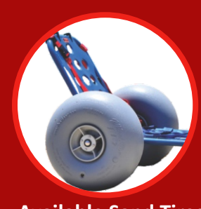
Available Sand Tires